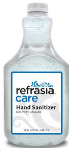
6-64 oz Pack Size