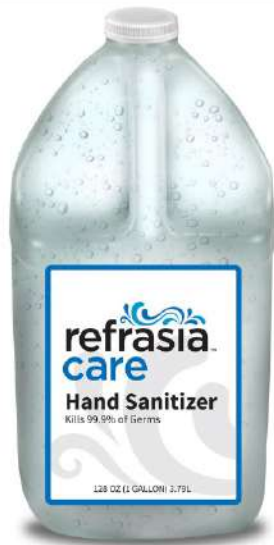
4-1 gal Pack Size